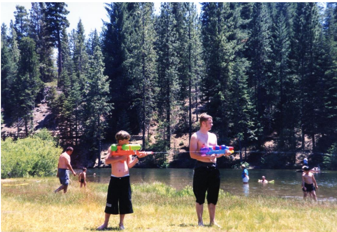
Perfect conditions for water guns!