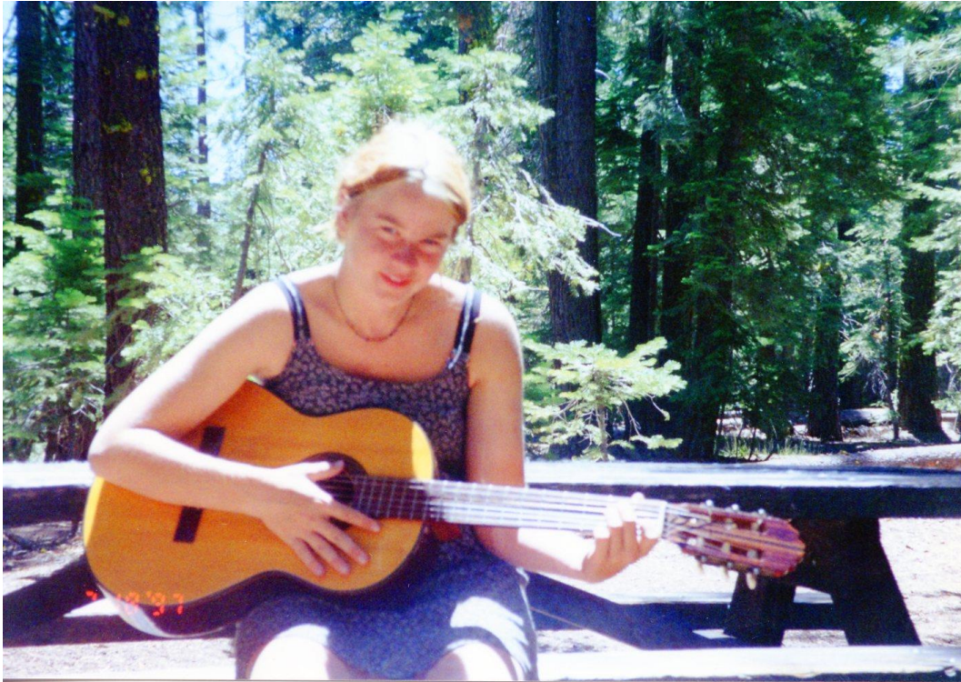
Chelsea led them singing Beatles songs